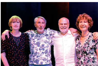
Equipe organisation France